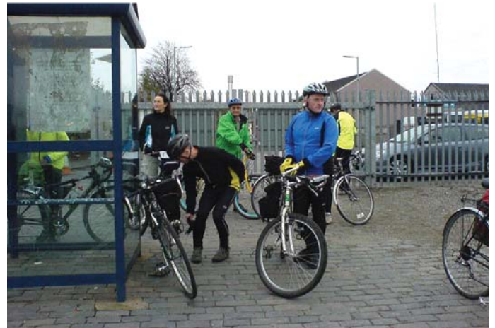
2. Cyclists meeting place