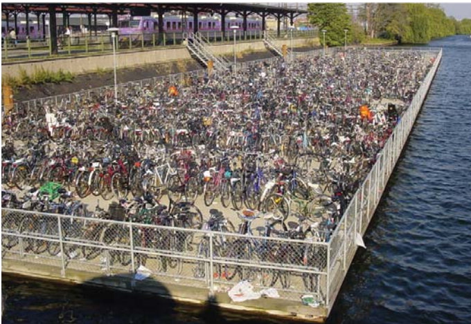
1. Bikes parked at Train Station