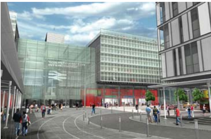
3. Interchange proposal - Wolverhampton, UK